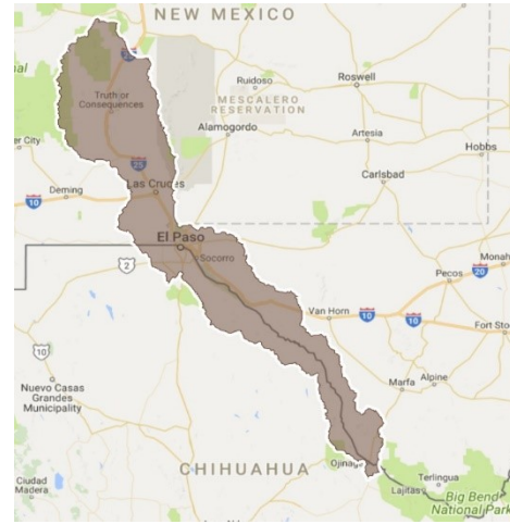
Figure 1: Map of the study area extending from Elephant Butte Reservoir in Southern New Mexico through the El Paso/Ciudad Juarez region in Texas and Chihuahua, Mexico to the entrance of the Rio Conchos from Mexico modified from [24].

- OWL [19] will further demonstrate the ability to share and reuse scientific knowledge and resources using knowledge representation languages.